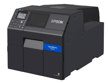
CW-C6000A 4" Auto Cutter

With a 4" or 8" built-in auto cutter covering the full spectrum of label sizes to create variable-length labels and enable easy job separation, these new ColorWorks models offer cost and inventory reductions compared to using pre-printed labels.