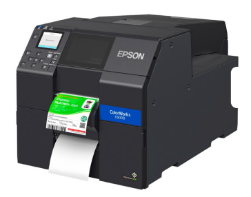
CW-C6000P 4" Peel-and-present

Epson offers the first color inkjet printer with peel-and-present capability, which can help speed up the manual application of on-demand labels. An integrated label-taking sensor holds off subsequent printing until the previous label is removed. This feature is ideally suited for fully automated label application systems. This unique capability eliminates the need for a loose loop and allows individual labels to be taken as soon as they are printed.