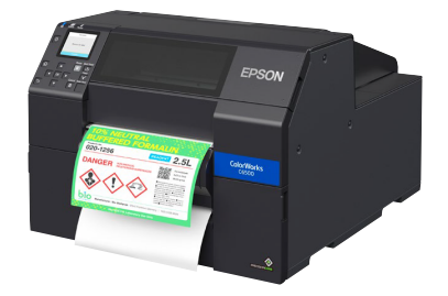
CW-C6500P 8" Peel-and-present