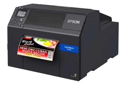
CW-C6500A 8" Auto Cutter